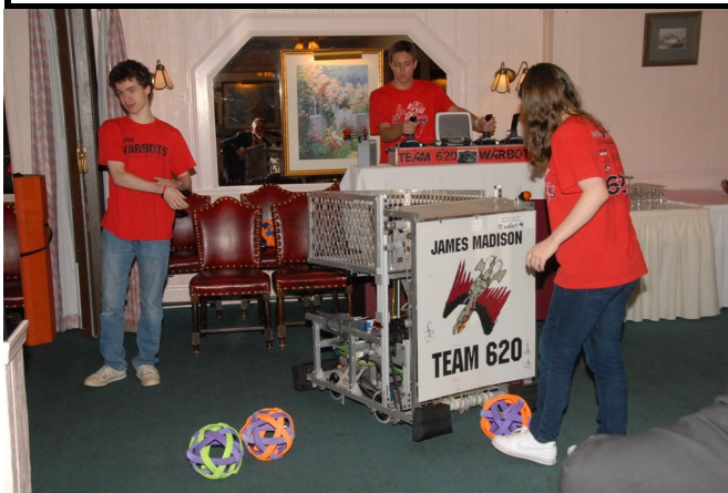
Members of Madison High School Robotics Team demonstrate their robot.