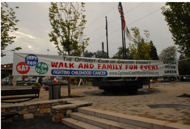
The day has arrived.

You're the happiest when you're making the greatest contribution.