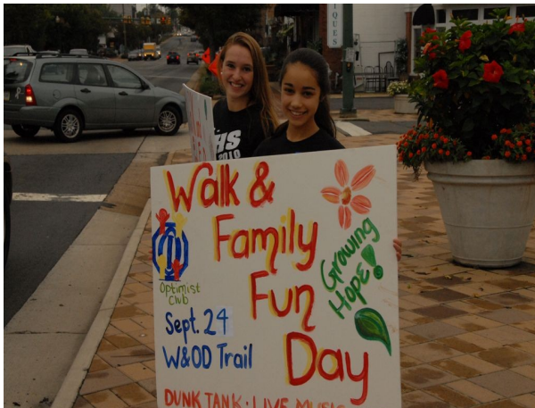
Showing the sign on Maple Avenue.