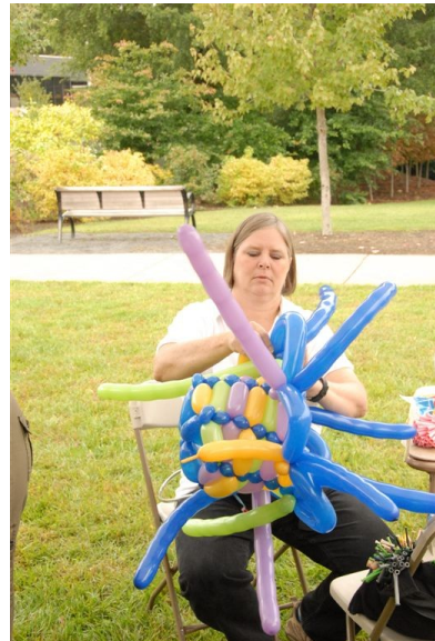
What is the balloon lady making?