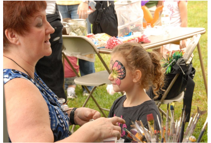
The face painting lady at work.