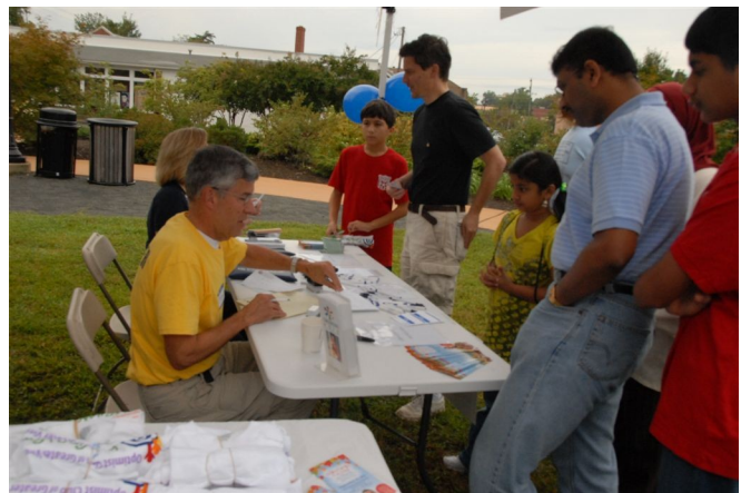
Even got the President working.